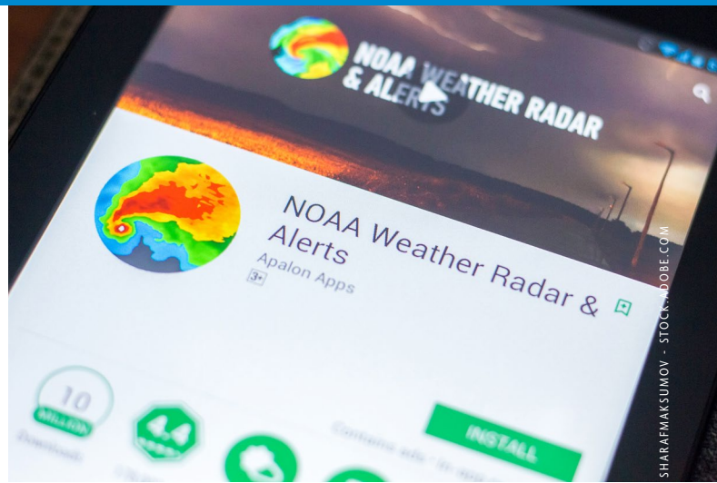
The National Oceanic and Atmospheric Administration (NOAA) provides a free app to check local weather and receive weather alerts during severe conditions.

When flying drones, remote-controlled planes, toys or kites, fly them in a wide-open area free from overhead power lines. If a toy or object gets stuck in an overhead power line, do not try to remove it. Instead, call your electric co-op and a crew will address the issue safely.